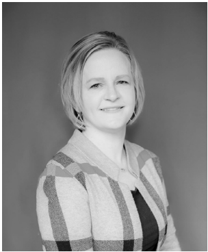
KANSAS CITY, KS - The Unified Government of Wyandotte County and