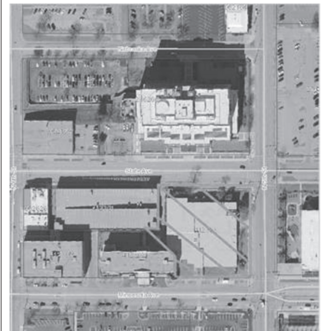
EXHIBIT D LEGAL DESCRIPTION OF REVISED REDEVELOPMENT DISTRICT AND REVISED REDEVELOPMENT PROJECT AREA

Revised Redevelopment District and Revised Redevelopment Project Area indicated by hashed area within map below and generally located at the southwest corner of State Avenue and N. 5th Street.