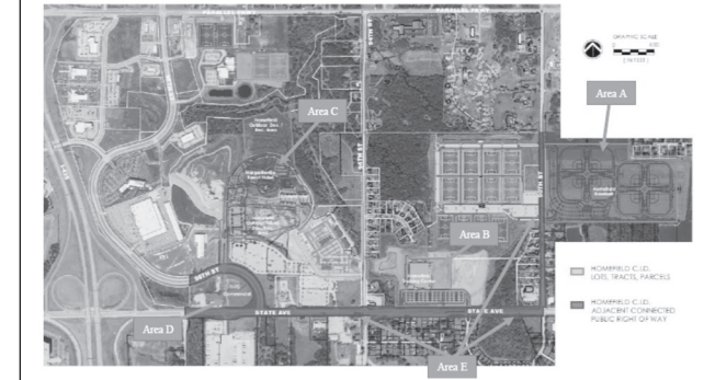
EXHIBIT B MAP OF COMMUNITY IMPROVEMENT DISTRICT