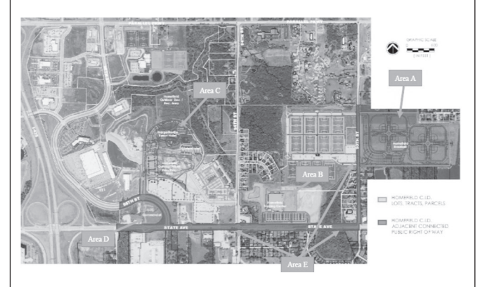
EXHIBIT C PROPOSED CID SPECIAL ASSESSMENTS

EXHIBIT B MAP OF PROPOSED HOMEFIELD COMMUNITY IMPROVEMENT DISTRICT